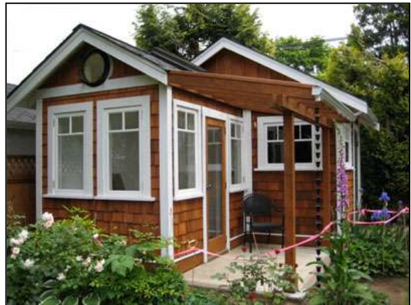
Laneway House – Vancouver, BC

The results from the public opinion survey indicate residents support housing options that allow for modifications to existing dwellings to enable elderly or disabled residents to live with them. These alterations include changes to existing dwellings to convert living space into a suite with minor cooking facilities, or constructing a small secondary dwelling or “granny flat” in the rear of the property. These flats are usually one bedroom, one bath with a common area that includes the living room and small cooking area. In general, the homes are quite small.