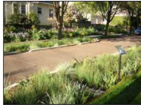
Low Impact Development – Portland, OR

The City of Oconomowoc, along with other parts of the nation, has begun seeing an increased interest in sustainable or green development. This type of development is commonly characterized by being environmentally friendly. There are numerous ways to make projects greener. One example as previously discussed is conservation subdivisions. A second way of greener developments is to increase the projects density and mix use. By mixing uses, people are able to walk to commercial and institutional uses without having to drive. Higher densities are greener since higher density uses the land more efficiently than lower density uses. In addition, higher density requires less future land for development and preserves farmland and open space.